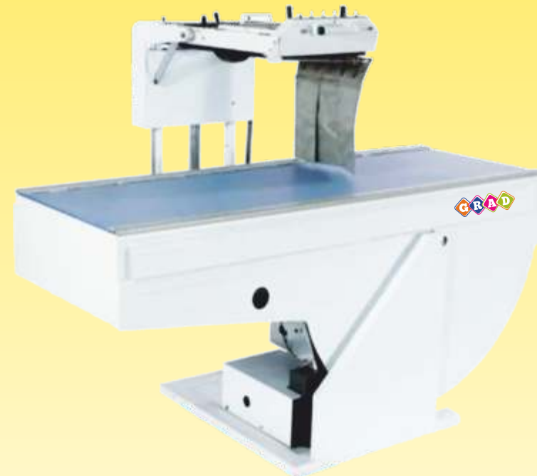
Motorized table with fluoroscopy & spot film Device

Conventional x-ray machine upgrade project is a kind of not changing traditional x-ray radiology method using a digital x-ray detector instead of the original film cassette replace the old darkroom and film processing, so the existing x-ray machine will update with modernize technology of digital usage systems. This will change conventional x-ray machine into DR system greatly improve the work effective and image quality can reduce the cost of radiography, reduce doctor workload and shorten taking time of the procedure.